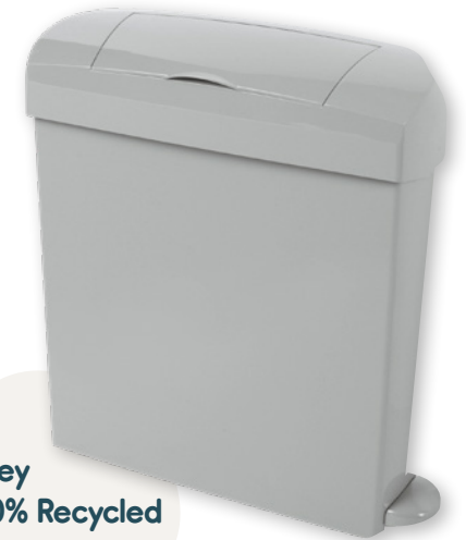
Grey 100% Recycled