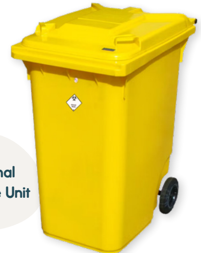
External Waste Unit

Capacity: 360 litres or 240 litres Dimensions: 1370mm(w) x 1090mm(h) x 780mm(d) 580mm(w) x 1070mm(h) x 740mm(d) Finishes: Yellow