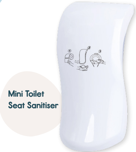
Mini Toilet Seat Sanitiser

Dimensions: 128mm(w) x 251mm(h) x 85mm(d)