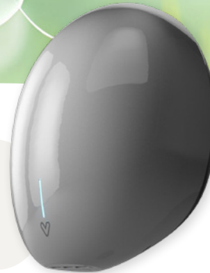
Orb & Orb+

Dimensions: 270mm(w) x 320mm(h) x 145mm(d)