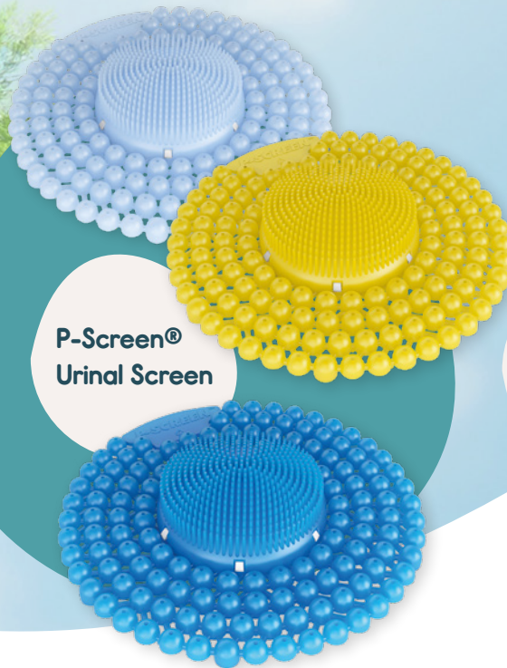
P-Screen® Urinal Screen

Our range of urinal and cubicle services helps you tackle bacteria and odours in the toilet and urinal bowl, keeping your male washroom clean and hygienic.