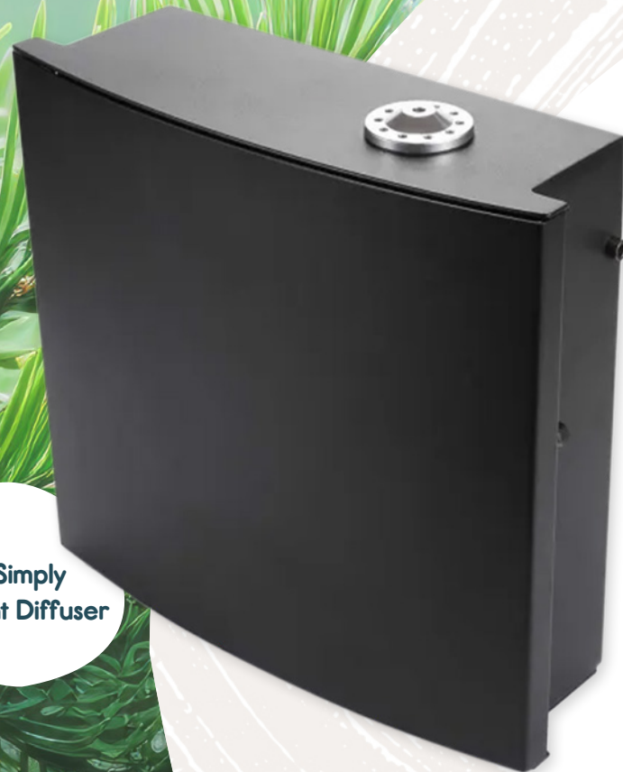
The Simply Scent Diffuser

Scent is an important emotional influencer – it can evoke memories and leave a lasting impression.