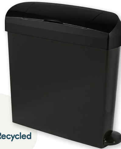
Black 100% Recycled

Our most popular range of hygiene units are 100% free of virgin plastic – designed and manufactured uniquely for Simply Washrooms. Available in black or grey finish, these units can also be fully recycled at the end of their life, making them the product of choice for businesses that put sustainability first.