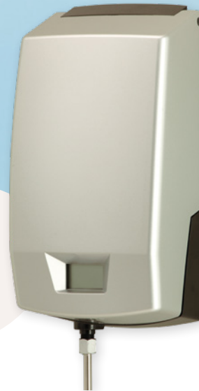
Urinal Sanitising Unit