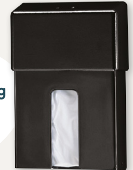
Hygiene Bag Dispenser